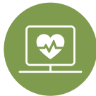
nGeniusPULSE Testing from anywhere