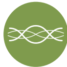
Smart Data Analytics